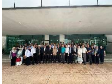
December 3, 2024