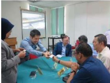
September 24, 2025