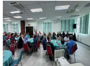
June 19, 2025